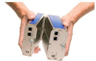
imc Click Mechanism

Alternatively, connection can be made by means of standard Ethernet cables (RJ45, CAT5), thus creating a spatially distributed system.