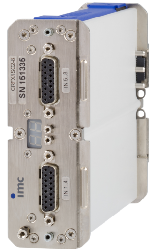
CRFX/ISO2-8 module shown in standard operating orientation