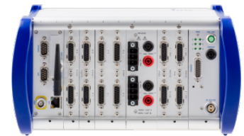
imc CRONOScompact portable housing