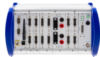
imc CRONOScompact portable housing