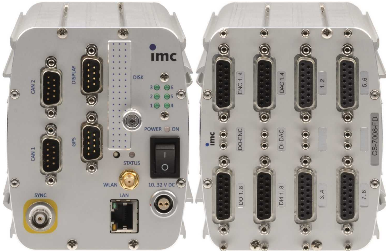
device type: CS-7008-FD, 8 analog measurement inputs

Universal and powerful compact measurement system