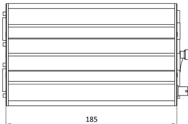
CS device shown in standard operating orientation.