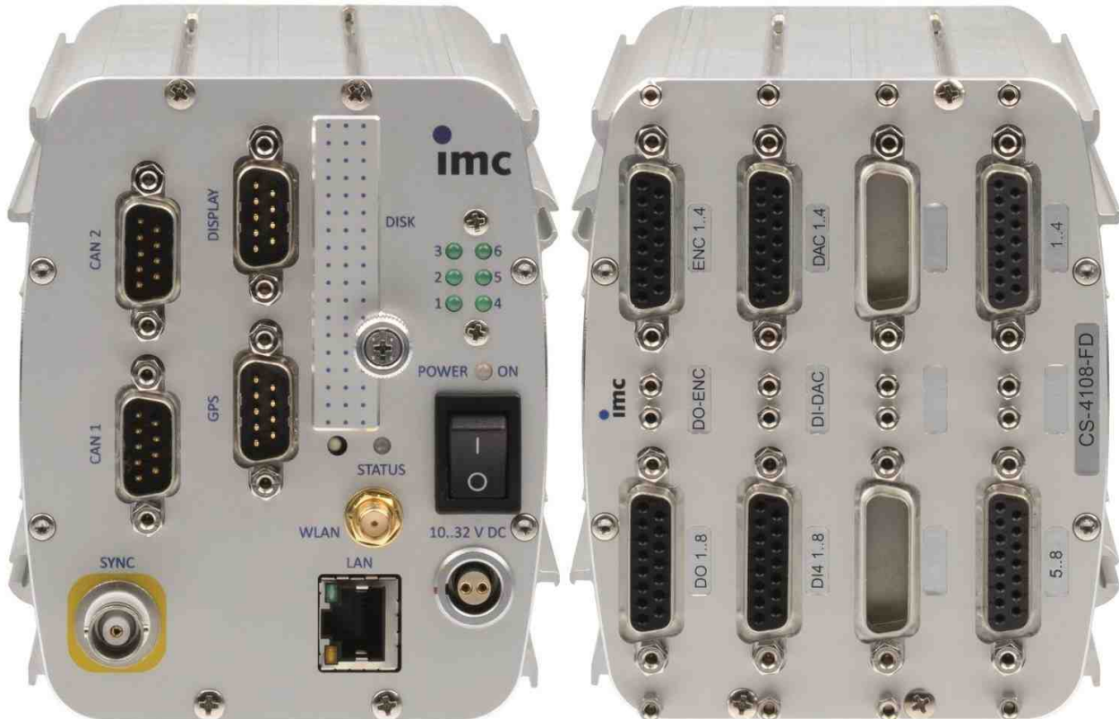
device type: CS-4108-FD, 8 analog measurement inputs

Compact and intelligent measurement system with isolated inputs