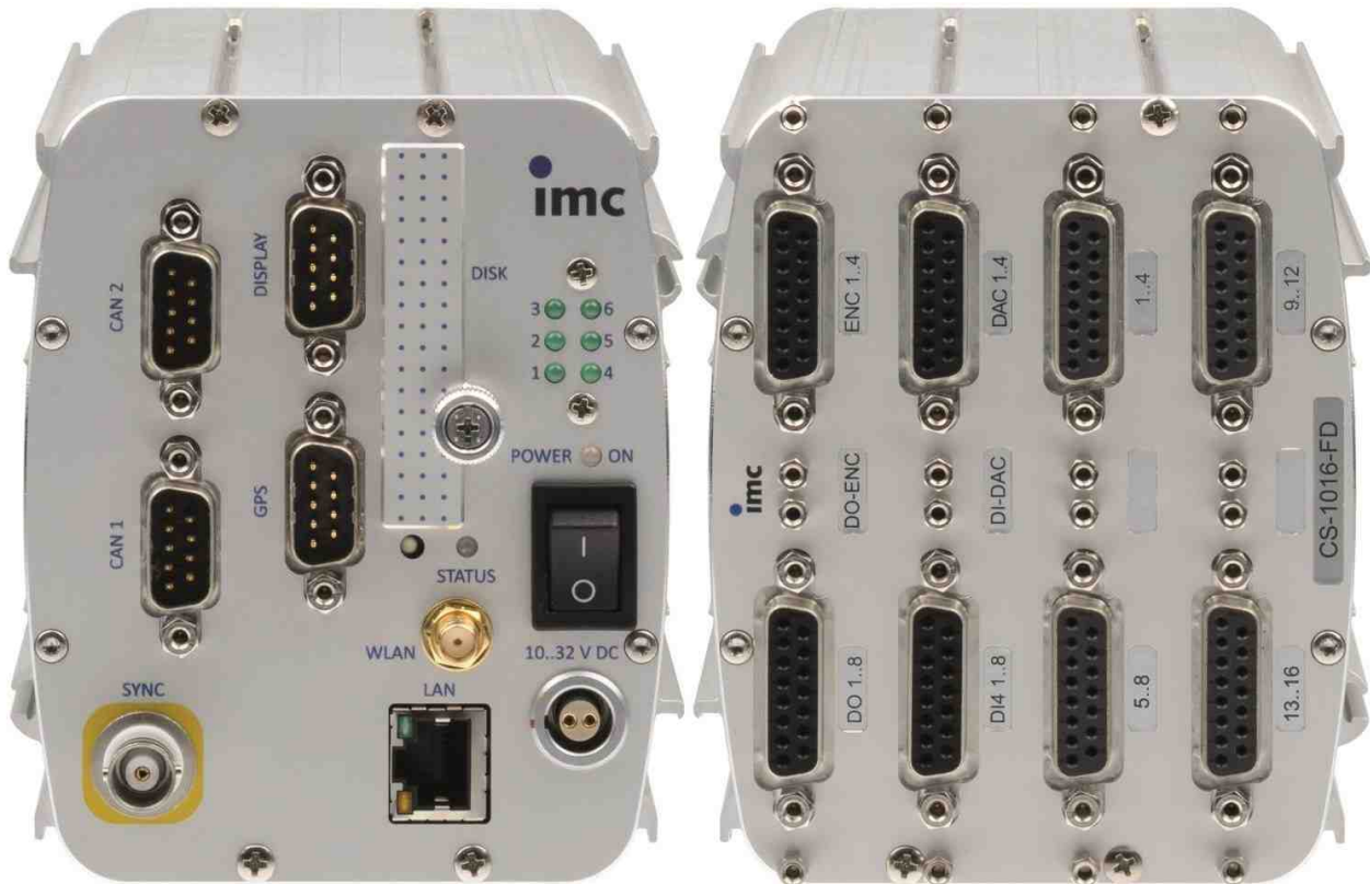
device type: CS-1016-FD (Fig. similar), 16 analog measurement inputs

Compact, intelligent and extensively equipped measurement system for voltage measurements