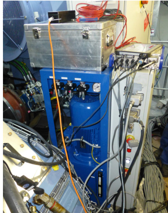
In operation: imc CRONOS-SL

waterproof plug. In addition to the self-sufficient, PC-free operation, including onboard memory, the user can connect the imc CRONOS-SL to a computer via an Ethernet TCP/IP interface (or optional WLAN). Establishing a measurement network with any additional synchronized imc measurement devices is also possible.