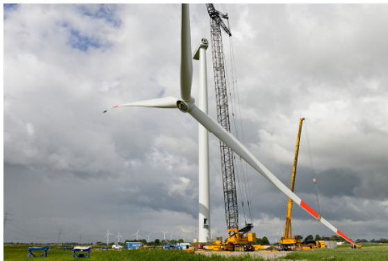
Traditional rotor star installation (photo) is being increasingly replaced with the single blade technique

Compared to the traditional rotor star installation, the new single blade installation does not attach the rotor blades to the rotor hub on the ground and lift them up as a complete unit. Instead, each blade is installed individually onto the hub after it is already mounted to the standing structure. Advantages of using the single blade installation are, among others, reducing the overall area for storage, a much smaller space is required for installation and dispensing with the need for two large cranes (as are needed for the full rotor star installation method).