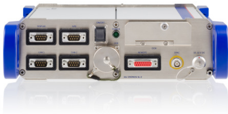
Rugged and user-friendly: imc CRONOS-SL

Senvion has opted for the imc CRONOS-SL measurement system for performing verification tests for single blade installation because it ideally fulfills their requirements.